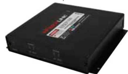
Fiberlink® 3352 Transceiver

Same Transceiver Unit at Each End of the Fiber!