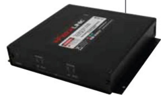
Fiberlink® 3352 Transceiver

The 3352 Receiver section delivers pristine output with two re-clocked, non-inverting, independently buffered 3G/HD/SD-SDI outputs!