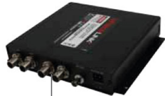
Fiberlink® 3352 Transceiver

The 3352 Transmitter section provides a convenient re-clocked and equalized 3G/HD/SD-SDI Loop-Through!